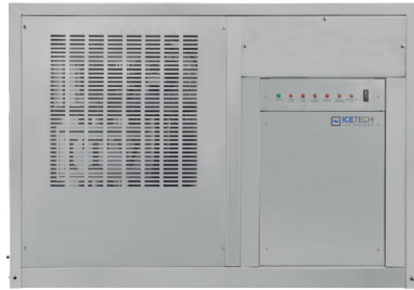
SC 400 / SC 600 Case