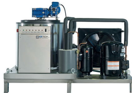
SC 1TN / SC 1,5TN / SC 2TN / SC 3TN / SC 5TN / SC 10TN